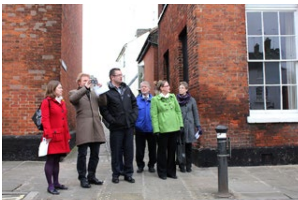
GROUP MEMBERS ON A TOUR OF THEIR COMMUNITY.

You would also have some good apartments and mixed-use buildings if appropriate. Don't worry, not every area will have examples of every type so if you wish to add them, you may need to go further afield to find good examples!